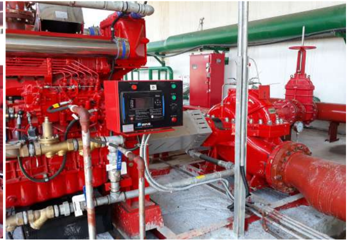
Project: MUDA Paper Mill Fire Fighting Pump