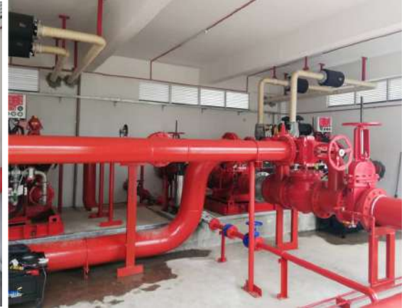
Project: Oil Terminal Fire Fighting Pump (Shell Philippines)