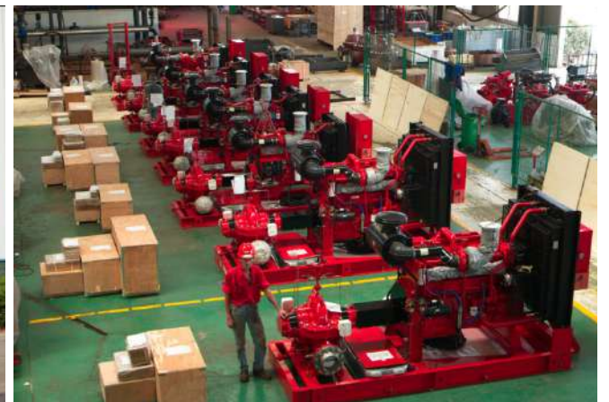
Project: Complete Package Fire Fighting Pump (NFPA20/UL/FM)