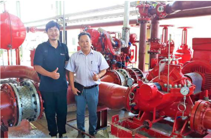
Project: Alliance Steel Fire Fighting Pump